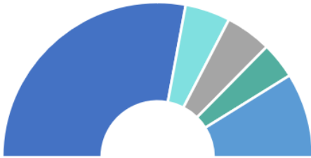
Coalitions Reflected in Seats in Lok Sabha 2019

■ BJP ■ NDA (BJP allies) ■ INC ■ INDIA (INC allies) ■ Other